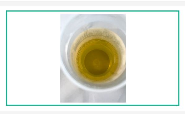
Terpenes (SOP 602)