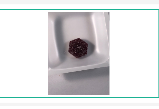
Terpenes (SOP 602)